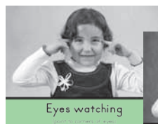
Eyes watching point to the corners of your eyes

Let's practice the Listening Rules. Tell your child about a pet. Have him or her copy the actions shown in the pictures on the Listening Rules Cards at right.