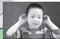
Ears listening cup your ears with your hands